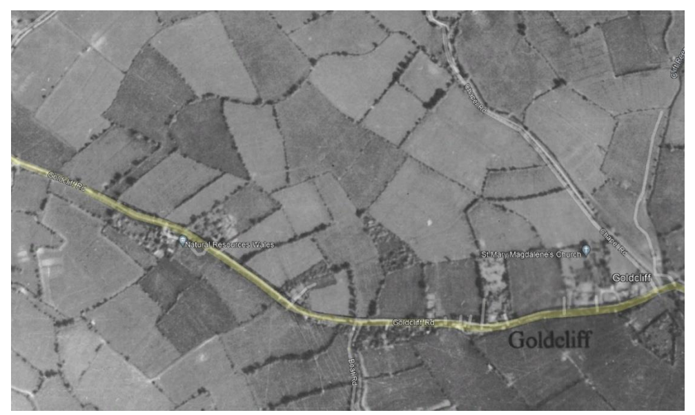
Figure 8: Aerial imagery from 1945 showing field boundaries and watercourses defined by hedgerow trees and shrubs

6.5 Hedgerows do not only provide a service to farms, they also sequester carbon in root and branch systems and can be managed for wildlife. Conventionally, hedgerows managed for wildlife should be diverse with a wide variety of species including fruiting plants, although