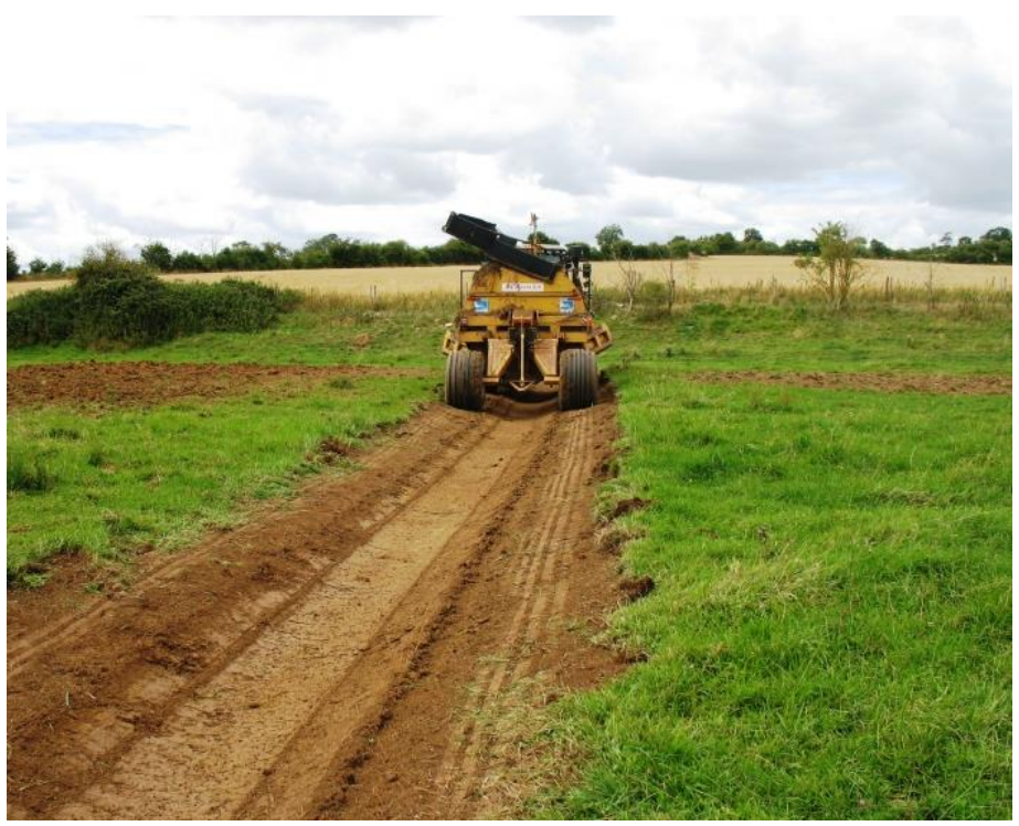
Figure 7: RSPB Rotary Drainer excavating a foot drain – the depth and width of the feature and spoil spreading can be adapted for use in the restoration of grips and furrows.