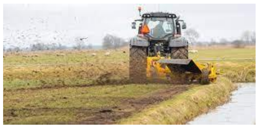
Figure 5: Spreading arisings left on bank top (Bos rotary cutter WA-150)