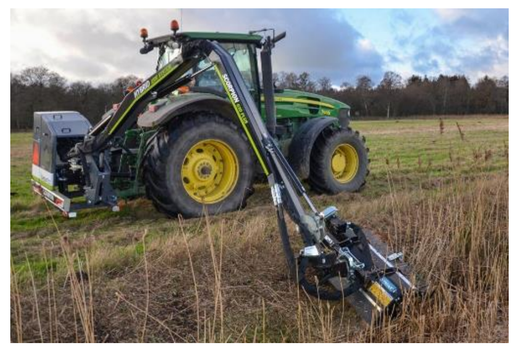
Figure 2: Greentec hydraulic flail mower