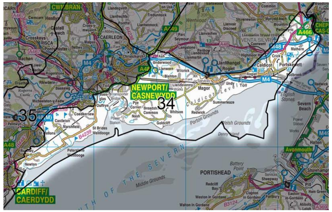
Figure 1 The extent of the Gwent Levels