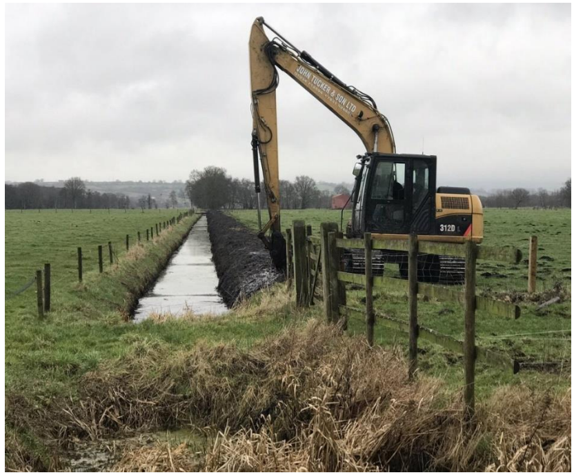
Figure 4: Desilting leaving arisings on bank top