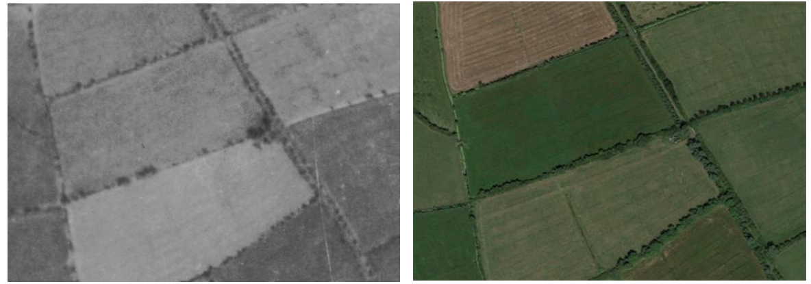
Figure 6: Established hedgerows and hedgerow plants along ditch lines. 1945 and 2021