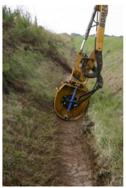
Figure 3: Desilting and spreading using a boom-mounted spreader (Klose Engineering)